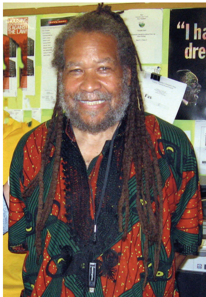
LAGUARDIA COMMUNITY COLLEGE VETERANS UPWARD BOUND PROGRAM